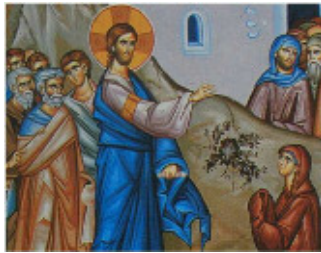
Jesus and the Canaanite Woman

8.00am Holy Eucharist (1662) 10.30am Solemn Eucharist (1989)